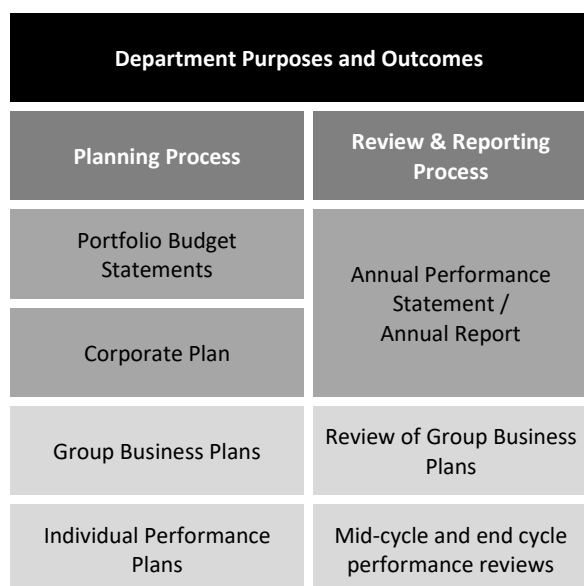
DSS planning and reporting framework