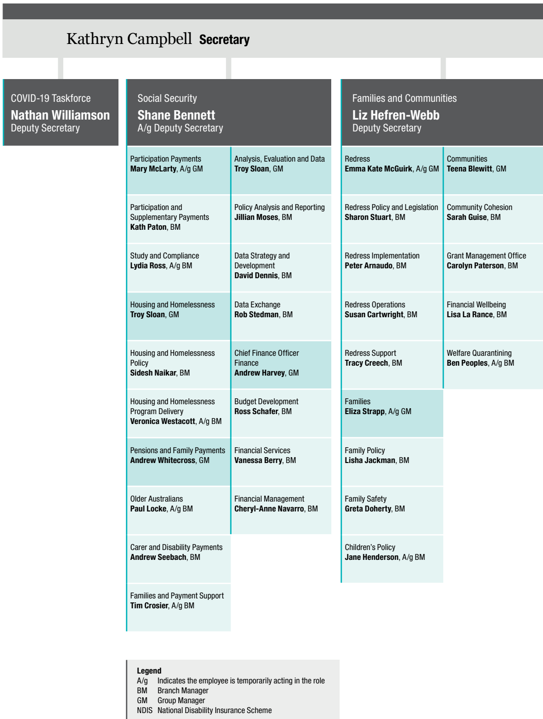
Figure 1.1.1 Organisational structure as at 30 June 2020