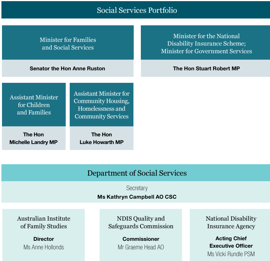
Figure 1.2.1: Social Services portfolio, as at 30 June 2019

Note: Services Australia, Digital Transformation Agency and Hearing Australia are not included in Figure 1.2.1.