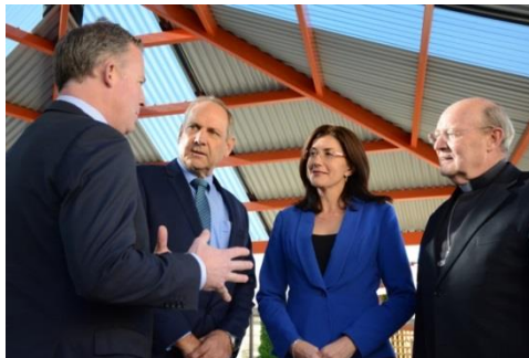
Image: The Premier and Minister for Women announce CatholicCare as the Safe Choices provider

Safe Choices is providing an alternative pathway for people in or wanting to leave violent relationships to seek practical, non-crisis support including information, advice and referral. Safe Choices is initially being trialled in southern Tasmania in 2016-17 and will then be rolled out to other regions.