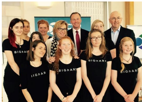
Image: Premier, Commissioner, Rosie Batty and Project O participants

The Tasmanian Government will make a formal response to the Report and will consider the findings as its ongoing response to family violence in Tasmania.