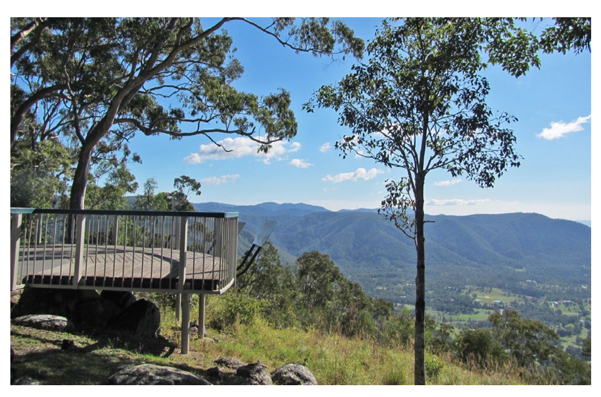
Image 2 - Wheelchair-accessible platform, Jolly's Lookout near Walkabout Creek, Queensland.