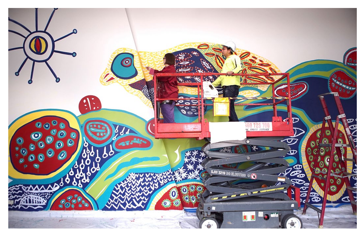
Image 3 - Emily Crockford painting mural at Westpac Service Centre, NSW.