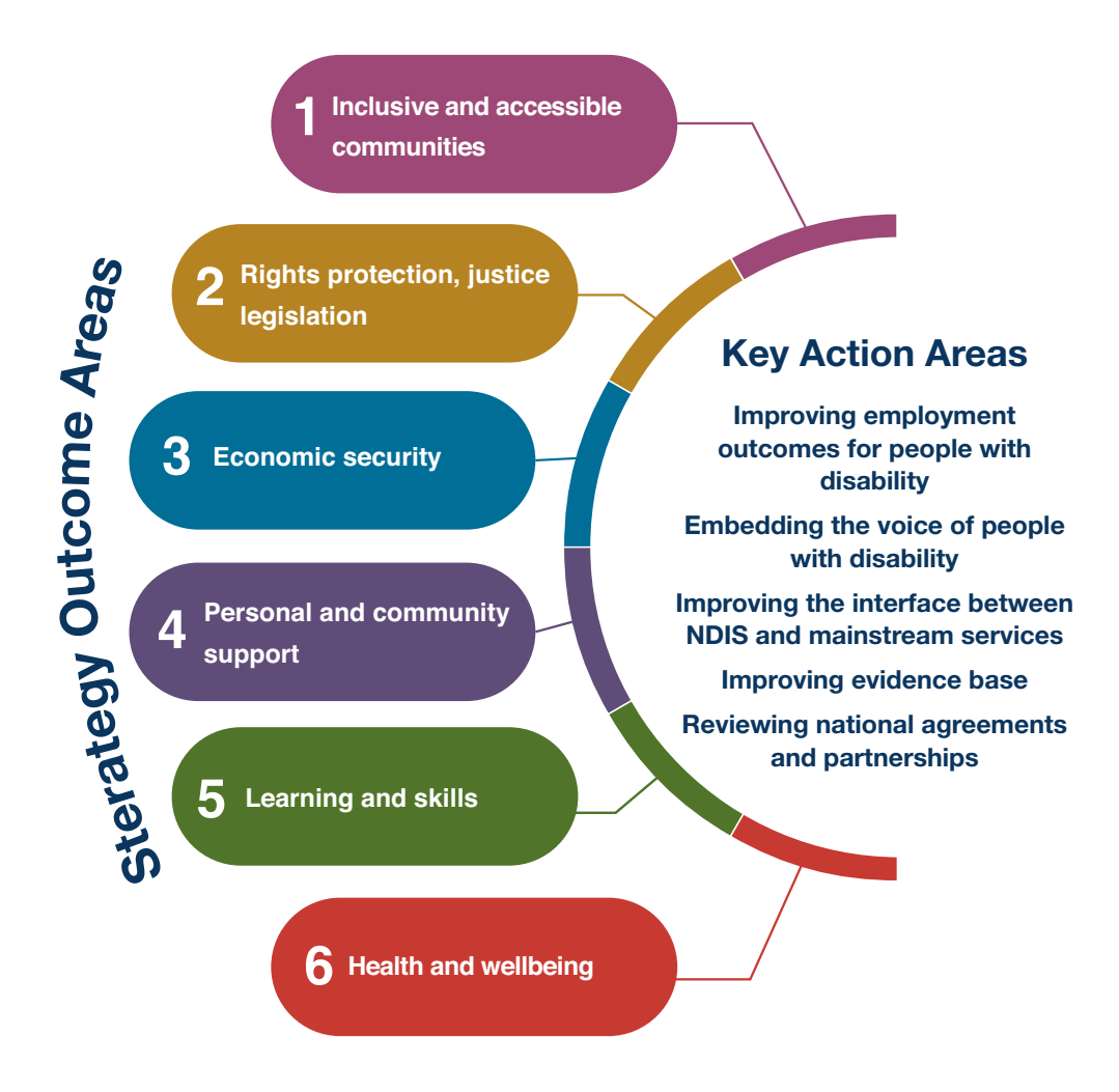
Figure 1 - The Third Implementation Plan's priority areas of focus support each outcome area of the National Disability Strategy

Since its inception, the Strategy has guided all levels of government to drive improvements for people with disability. The introduction of the National Disability Insurance Scheme (NDIS) is undoubtedly the single greatest achievement of the Strategy. But the Strategy is for all Australians, not just people with disability participating in the NDIS. The Strategy has made gains across communities—in transport, year 12 attainment, building accessibility and employment to name a few—that have improved outcomes for people with disability, and for their communities. However, there is still more to do.