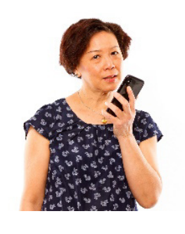
Speak and listen