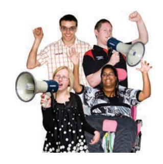
Standard 1: Rights

There are 6 Standards. We explain them briefly here, and then we go into more detail on the following pages.