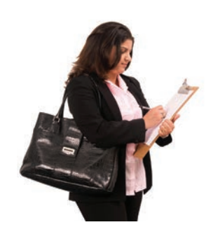
Standard 6: Service Management

Finding and using services is fair. You can access the services you need.