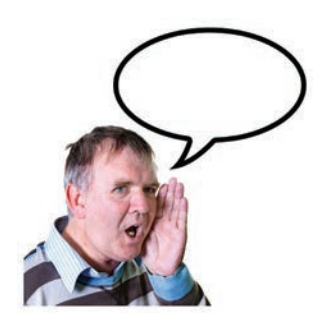
Standard 4: Feedback and Complaints

Your service supports you to make choices about what you want to do. You can work toward your goals.