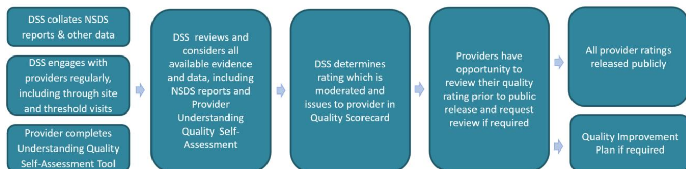
Figure 2: Overview of the quality assessment process

A quality rating for each provider will be released every six months capturing performance over a rolling 12-month period. This allows the incorporation of NSDS Audits that are conducted annually.