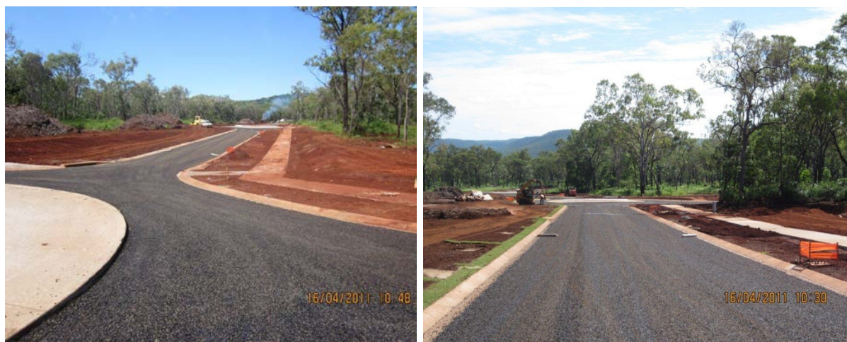
Figure 3. Hope Vale, Queensland

NPARIH funding for housing-related infrastructure has resulted in major upgrades to capital infrastructure, such as water storage, sewer ponds, roads and pipes, in eight communities in the Northern Territory.