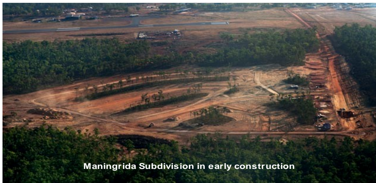
Figure 1. Maningrida, Northern Territory

In a number of the larger remote communities, whole new subdivisions of housing have been constructed or are underway to help alleviate overcrowding in those communities.