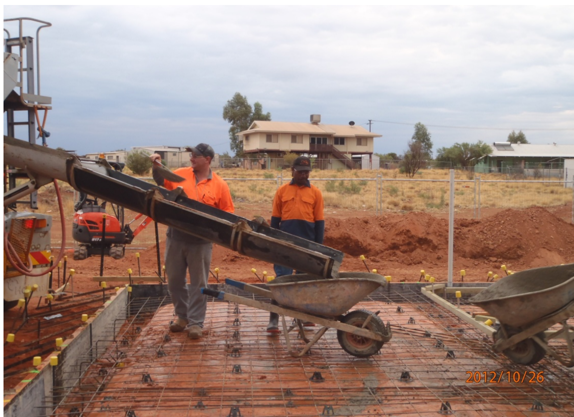
Figure 11. Pouring a slab, Northern Territory

Both the Territory Alliance and the New Future Alliance put in place well-developed strategies for engaging and retaining local people. The alliances also provided support and worked in partnership with local Indigenous run enterprises involved in the construction processes in a number of NT communities.