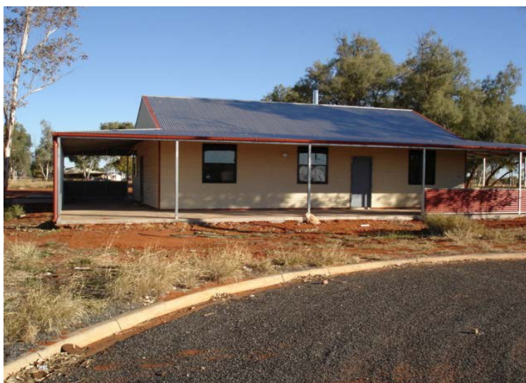
Figure 6. Napranum, Queensland