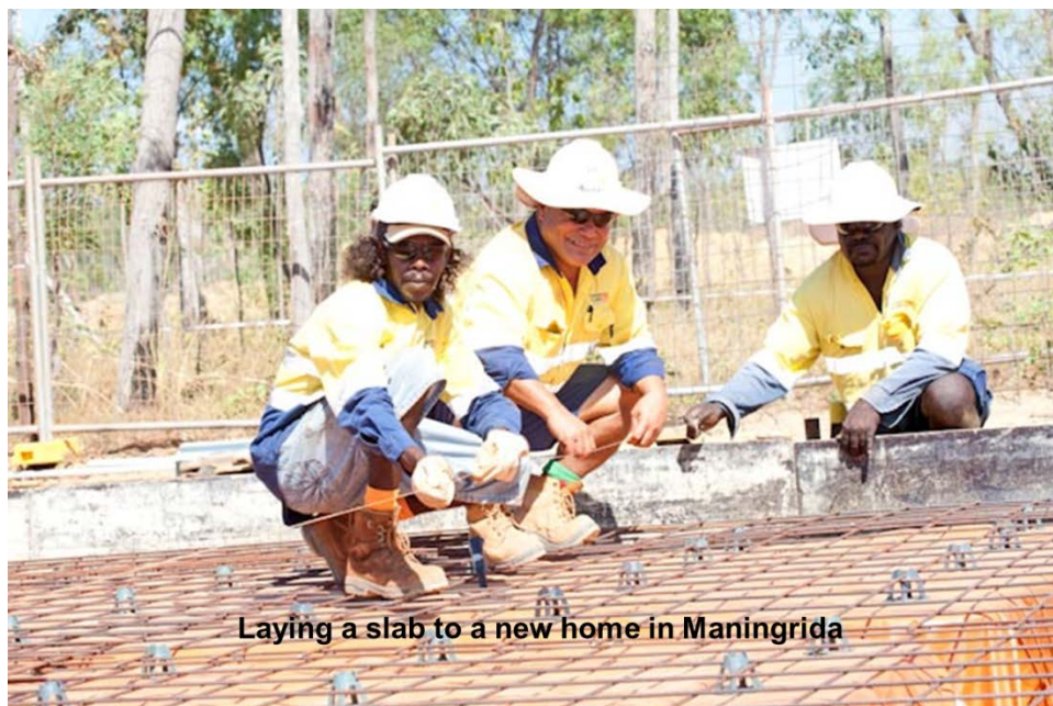
Figure 12. Maningrida, Northern Territory

In Western Australia, three workshops are being organised in different locations to provide information for contractors on government contracting opportunities flowing from the NPARIH. The workshops are focussing on Indigenous employment and business opportunities. The first workshop was held in Broome. They are being organised jointly by two Western Australian Government agencies, Housing and Indigenous Affairs and the Commonwealth Department of FaHCSIA.