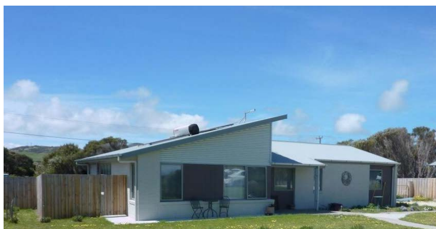
Figure 7. Flinders Island, Tasmania

Responding to this level of scrutiny has at times been highly resource-intensive for the housing authorities and others involved. However, it has also provided valuable lessons and additional incentive to all jurisdictions to continuously strive to lift performance.