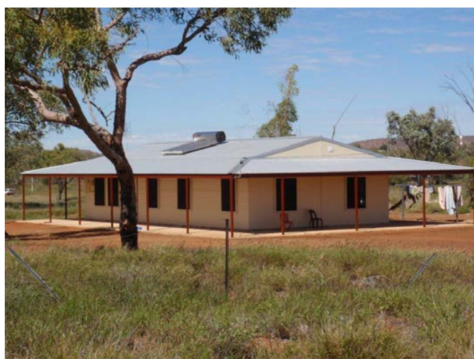
Figure 8. Mardiwah Loop, Western Australia