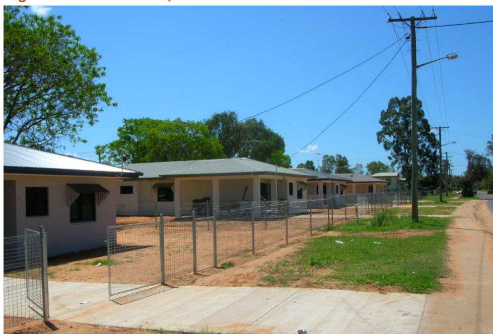
Figure 2. Woorabinda, Queensland