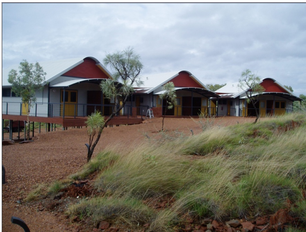
Figure 13. Buraluba Yara Ngurra hostel – Halls Creek, Western Australia