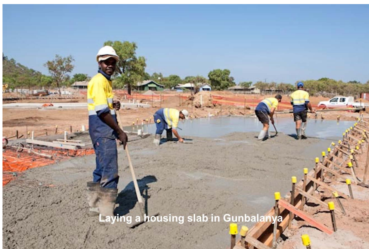
Figure 10. Gunbalanya, Northern Territory

Note: Tasmania completed its 2011-12 capital works in 2010-11 and reported a 22 per cent Indigenous employment outcome during construction.