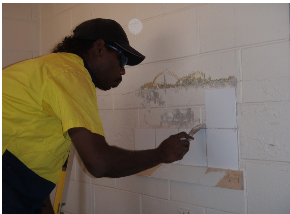
Figure 9. Home fixtures, Northern Territory

The NPARIH requires 20 per cent local Indigenous employment during construction over the life of NPARIH. This benchmark has been consistently achieved and often exceeded, although there has been criticism that some of the jobs have been taken up by Indigenous people from outside the local community where the works are proceeding. The Commonwealth Ombudsman noted this in the June 2012 report on Remote Housing Reforms in the Northern Territory and subsequently Commonwealth and Northern Territory housing agencies agreed to clarify the definition for the purposes of the NPARIH benchmark.